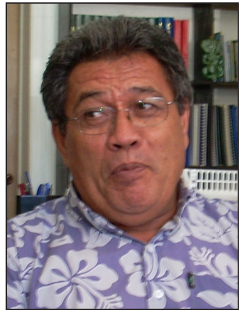
Wilkie Rasmussen, condemned for critiquing the Demo Leaders

When the former Leader of the Opposition and Democratic Party Leader Wilkie Rasmussen said in his CI News column on 18 January 2016 "Politics is not a game of tiddly winks," one could sense his despondence and disappointment at how far the Democratic Party opposition had regressed and had become reduced to the incompetence of the two people who dictated their direction.